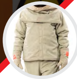
CHARNAUD® SURVIVE-ARC® 100 cal/cm² CAT 4 Switching Jacket , Olive.