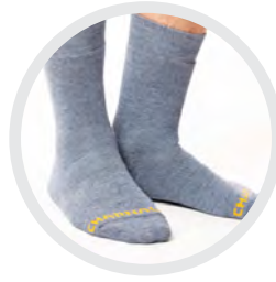
CHARNAUD® SURVIVE-ARC® Socks, Grey Highly moisture absorbent and anti-bacterial. Sizes: One size fits all Protection Level: EN 531; EN ISO 14116 and CE certified.