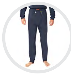
CHARNAUD® SURVIVE-ARC® 10.9 cal CAT 2 Long Johns, Navy. With elasticated waist and ribbed leg ends. Sizes: S – 5XL