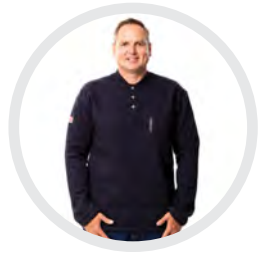
CHARNAUD® SURVIVE-ARC® 21 cal/cm² CAT 2 Long sleeve Henley Shirt, Navy. Pull over top with 3 button closure and knitted cuffs. Sizes: S – 5XL