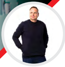
CHARNAUD® SURVIVE-ARC® 21 cal/cm² CAT 2 Round neck jersey, Navy. Pull-over top with knitted cuffs. Sizes: S – 5XL