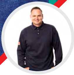
CHARNAUD® SURVIVE-ARC® 10.9 cal/cm² CAT 2 Long sleeve Polo Shirt, Navy. 3 button polo shirt with collar and knitted cuffs. Sizes: S – 5XL