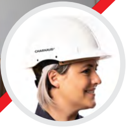
CHARNAUD® SURVIVE-ARC® Dielectric Hard Hat Dielectric to 20 kV, heat resistant, slotted hard hat with superior suspension system and chin strap. Option: Chin strap Protection Level: EN 397: 2012 + A1: 2012 EN 50365 ANSI/ISEA Z89.1, Class E, Type 1