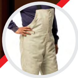
CHARNAUD® SURVIVE-ARC® 100 cal/cm² Switching Bib and Brace Trousers , Olive.