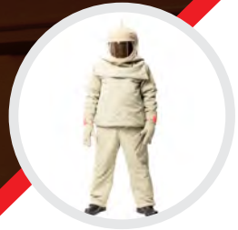
CHARNAUD® SURVIVE-ARC® 100 cal/cm² Arc Flash Switching Suit Set , Olive. Items can be ordered individually.

Arc flash switching suits are available in the form of a set comprising: jacket, trousers, hood, gloves and carry bag. Items can also be ordered individually. A ventilated hood and a light on the hood are optional.