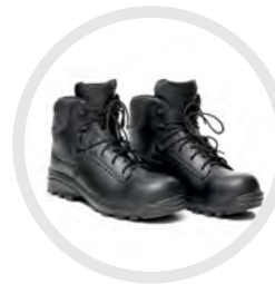
CHARNAUD® SURVIVE-ARC® E20300 Work Boot Safety half boot with laces, lining and padded collar. Colour: Black Protection Levels: EN ISO 20345:2011. CE Certified. Outsole: Electrical shock resistant up to 20kV (dry conditions) (Test method - ASTM F2412-05: 2005 mod).