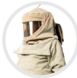
CHARNAUD® SURVIVE-ARC® 100 cal/cm² CAT 4 Switching Hood , Olive with Grey visor.