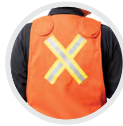
CHARNAUD® SURVIVE-ARC® 12.4 cal/cm² CAT 2 Braces, Orange with 50mm FR lime/silver reflective tape. Adjustable braces. To be worn over arc rated garment to protect against electric arc flash.