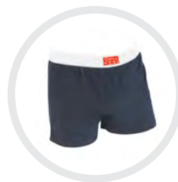
CHARNAUD® SURVIVE-ARC® 10.9 cal/cm² CAT 2 Boxer Underpants, Navy. With elasticated waist. Sizes: S – 5XL