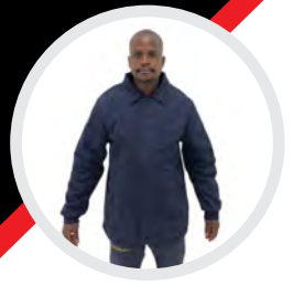
CHARNAUD® SURVIVE-ARC® 40 cal/cm² CAT 4 Winter Jacket With warm knitted liner. Sizes: S – 5XL