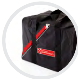
CHARNAUD® SURVIVE-ARC® Kit bag , Black. Carry bag with supported base with 2 carry straps around bag and heavy-duty U-shaped top zip.