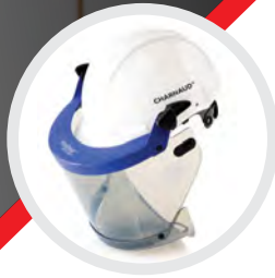
CHARNAUD® SURVIVE-ARC® 14 cal/cm² CAT 2 or 25 cal/cm² Highly Transparent Face-shield with Dielectric Hard Hat Headgear kit, Grey consisting of 3 components that must be used together as a KIT to achieve the arc rating indicated: transparent face shield with improved optical correctness, bracket and a chin protector. Sizes: One size fits all