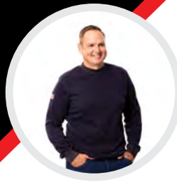
CHARNAUD® SURVIVE-ARC® 10.9 cal/cm² CAT 2 Long sleeve T-Shirt, Navy. Crew-neck T-Shirt with ribbed neck and cuffs. Sizes: S – 5XL