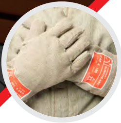
CHARNAUD® SURVIVE-ARC® 100 cal/cm² CAT 4 Gloves , Olive.