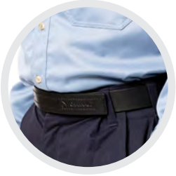
CHARNAUD® SURVIVE-ARC® Belt with Velcro® closure, Black. 40mm wide.